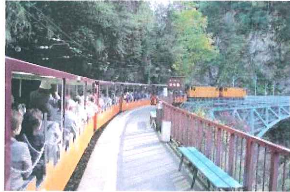
【The Torokko Train】