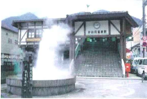
【Unazuki Onsen Stn.】