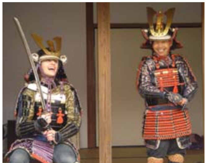
Boso Vilage, one of the many transit tours available

For more information please visit www.thamesfestival.org